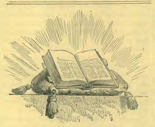
ASK FOR THE CUIDE-BOOK.

"Whatsoever things are true, whatsoever things are honest-whatsoever things are just, whatsoever things are pure, what acever things are lovely, whatsoever things are of good report, if there he any virtue, and if there he any praise, think on these things."—Phil.4:8.